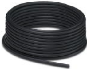
Cable ring, halogen-free PUR, black, 6-pos., conductor colors: brown / white / blue / black /gray / pink, cable length: 100 m

Please be informed that the data shown in this PDF Document is generated from our Online Catalog. Please find the complete data in the user's documentation. Our General Terms of Use for Downloads are valid ( http://phoenixcontact.com/download )