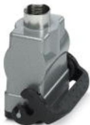
HEAVYCON B10 coupling housing, with single locking latch, height: 77.5 mm, with 1 x M25 gland, straight cable outlet

Please be informed that the data shown in this PDF Document is generated from our Online Catalog. Please find the complete data in the user's documentation. Our General Terms of Use for Downloads are valid ( http://phoenixcontact.com/download )