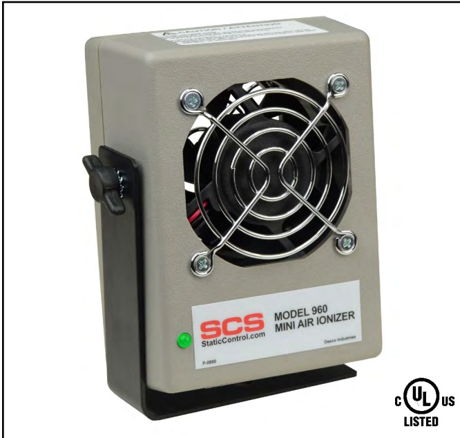
Figure 1. SCS 960 Mini Air Ionizer