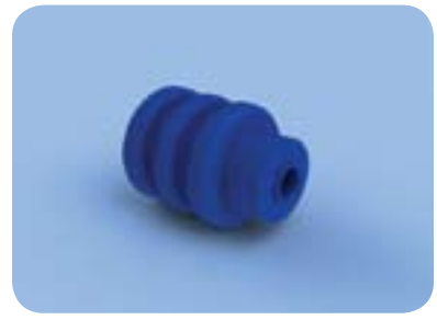
Single Wire Seal

*Note: -0 for tin finish, -1 for gold. See Mini-Universal MATE-N-LOK section in catalog 82181 for details.