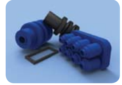
Single & Gang Wire Seals with Interfacial Seal

*Note: -0 for tin finish, -1 for gold. See Mini-Universal MATE-N-LOK section in catalog 82181 for details.