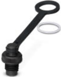
M8 sealing cap made of plastic with fixing band, for free M8 sockets, with 11.5 mm fastening eye

Please be informed that the data shown in this PDF Document is generated from our Online Catalog. Please find the complete data in the user's documentation. Our General Terms of Use for Downloads are valid ( http://phoenixcontact.com/download )