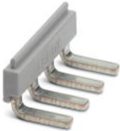
Insertion bridge, Pitch: 6.15 mm, Number of positions: 4, Color: blue

Please be informed that the data shown in this PDF Document is generated from our Online Catalog. Please find the complete data in the user's documentation. Our General Terms of Use for Downloads are valid ( http://phoenixcontact.com/download )