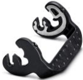
Replacement plastic single locking latch for standard housings of type B10

Please be informed that the data shown in this PDF Document is generated from our Online Catalog. Please find the complete data in the user's documentation. Our General Terms of Use for Downloads are valid ( http://phoenixcontact.com/download )