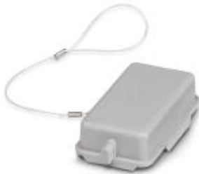
HEAVYCON protective cover, type B10, for supporting base element with single locking latch, with retaining cord, IP54, PA

Please be informed that the data shown in this PDF Document is generated from our Online Catalog. Please find the complete data in the user's documentation. Our General Terms of Use for Downloads are valid ( http://phoenixcontact.com/download )