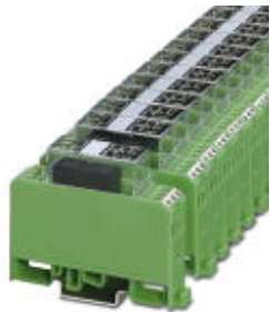
Relay module, with soldered-in miniature switching relay, contact (AgPd60 5 µm hard gold-plated): Medium to large loads, double A2 connection, 1 PDT, input voltage 24 V AC/DC

Please be informed that the data shown in this PDF Document is generated from our Online Catalog. Please find the complete data in the user's documentation. Our General Terms of Use for Downloads are valid ( http://phoenixcontact.com/download )