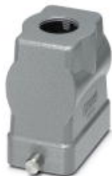
HEAVYCON B10 sleeve housing, for single locking latch, height: 72 mm, with 1 x M20 thread, straight cable outlet

Please be informed that the data shown in this PDF Document is generated from our Online Catalog. Please find the complete data in the user's documentation. Our General Terms of Use for Downloads are valid ( http://phoenixcontact.com/download )