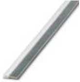
Continuous plug-in bridge, mounting type: Plug-in mounting, Color: gray

Continuous plug-in bridge - FBST 500 TMC-N GY - 0901028