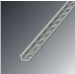
DIN rail, material: steel, perforated, height 5.5 mm, width 15 mm, length: 2 m

Please be informed that the data shown in this PDF Document is generated from our Online Catalog. Please find the complete data in the user's documentation. Our General Terms of Use for Downloads are valid ( http://phoenixcontact.com/download )