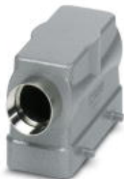
HEAVYCON B16 sleeve housing, for double locking latch, height: 76 mm, with 1 x Pg29 gland, lateral cable outlet

Please be informed that the data shown in this PDF Document is generated from our Online Catalog. Please find the complete data in the user's documentation. Our General Terms of Use for Downloads are valid ( http://phoenixcontact.com/download )