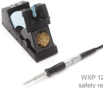
WXP 120 set with safety rest WDH 10