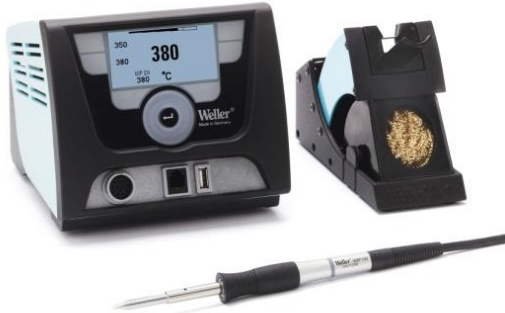
WX 1 control unit with WXP 120 (120 W / 24 V) soldering pencil and WDH 10 safety rest