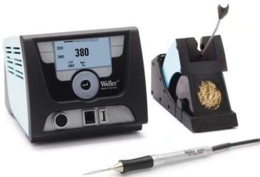
WX 1 control unit with WXMP Micro soldering pencil (40W / 12V) and WDH 50 safety rest