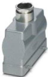
HEAVYCON B24 sleeve housing, for double locking latch, height: 76 mm, with 1 x M32 screw connection, straight cable outlet

Please be informed that the data shown in this PDF Document is generated from our Online Catalog. Please find the complete data in the user's documentation. Our General Terms of Use for Downloads are valid ( http://phoenixcontact.com/download )