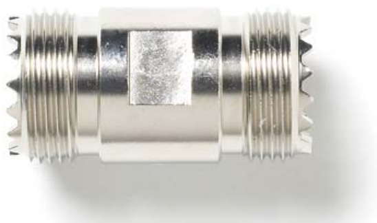
Model 73058 UHF Jack to Jack Adapter