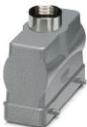
HEAVYCON sleeve housing B24, for double locking latch, height 76 mm, with support 1x M32, straight conductor exit

Please be informed that the data shown in this PDF Document is generated from our Online Catalog. Please find the complete data in the user's documentation. Our General Terms of Use for Downloads are valid ( http://phoenixcontact.com/download )