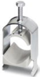
Cable clamp, for DIN rails

Please be informed that the data shown in this PDF Document is generated from our Online Catalog. Please find the complete data in the user's documentation. Our General Terms of Use for Downloads are valid ( http://phoenixcontact.com/download )