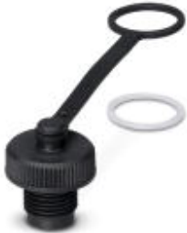
M12 sealing cap with fixing band, for free M12 sockets with 14.5 mm fastening eye

Please be informed that the data shown in this PDF Document is generated from our Online Catalog. Please find the complete data in the user's documentation. Our General Terms of Use for Downloads are valid ( http://phoenixcontact.com/download )