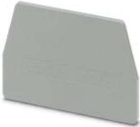
End cover, Length: 61 mm, Width: 2.2 mm, Color: gray

Please be informed that the data shown in this PDF Document is generated from our Online Catalog. Please find the complete data in the user's documentation. Our General Terms of Use for Downloads are valid ( http://phoenixcontact.com/download )