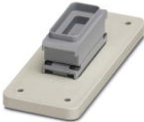
Adapter plate, size B16, reinforced, including panel mounting frame with DSUB 9 protective cover and without contact insert

Please be informed that the data shown in this PDF Document is generated from our Online Catalog. Please find the complete data in the user's documentation. Our General Terms of Use for Downloads are valid ( http://phoenixcontact.com/download )