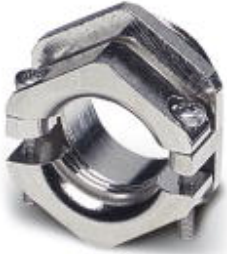
Pressure screws, with strain relief clamps, nickel-plated brass, clamping area 25.5 mm ... 34 mm, type Pg36

Please be informed that the data shown in this PDF Document is generated from our Online Catalog. Please find the complete data in the user's documentation. Our General Terms of Use for Downloads are valid ( http://phoenixcontact.com/download )