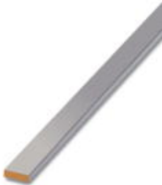
PEN conductor busbar, 3mm x 10 mm, length: 1000 mm

Please be informed that the data shown in this PDF Document is generated from our Online Catalog. Please find the complete data in the user's documentation. Our General Terms of Use for Downloads are valid ( http://phoenixcontact.com/download )