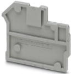
End cover, Length: 48 mm, Width: 2.5 mm, Height: 47 mm, Number of positions: 1, Color: gray

Please be informed that the data shown in this PDF Document is generated from our Online Catalog. Please find the complete data in the user's documentation. Our General Terms of Use for Downloads are valid ( http://phoenixcontact.com/download )