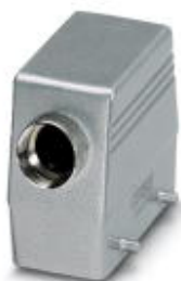
HEAVYCON sleeve housing B16, for double locking latch, height 76 mm, with support 1x M32, lateral conductor exit

Please be informed that the data shown in this PDF Document is generated from our Online Catalog. Please find the complete data in the user's documentation. Our General Terms of Use for Downloads are valid ( http://phoenixcontact.com/download )