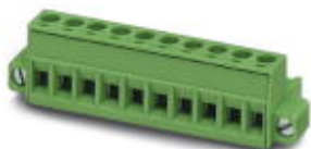
The figure shows the standard item

PCB connector, nominal current: 12 A, number of positions: 3, pitch: 5.08 mm, connection method: Screw connection with tension sleeve, color: green, contact surface: Gold