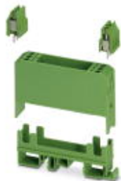
Electronic housing set, consisting of electronic housing and printed circuit termination blocks, pitch 5

Please be informed that the data shown in this PDF Document is generated from our Online Catalog. Please find the complete data in the user's documentation. Our General Terms of Use for Downloads are valid ( http://phoenixcontact.com/download )