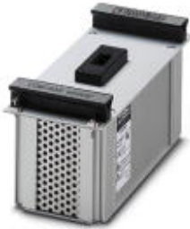
Test adapter for COMTRAB-CTM

Please be informed that the data shown in this PDF Document is generated from our Online Catalog. Please find the complete data in the user's documentation. Our General Terms of Use for Downloads are valid ( http://phoenixcontact.com/download )