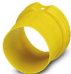
Opener for corrugated tube, to disassemble corrugated tube screw connection, size M40

Please be informed that the data shown in this PDF Document is generated from our Online Catalog. Please find the complete data in the user's documentation. Our General Terms of Use for Downloads are valid ( http://phoenixcontact.com/download )