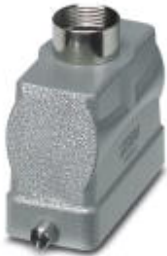
HEAVYCON sleeve housing B6, for single locking latch, height 72 mm, with support 1x M25, straight conductor exit

Please be informed that the data shown in this PDF Document is generated from our Online Catalog. Please find the complete data in the user's documentation. Our General Terms of Use for Downloads are valid ( http://phoenixcontact.com/download )