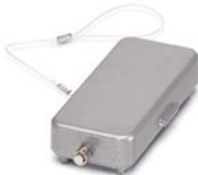
HEAVYCON protective cover, type B16, for supporting base element with single locking latch, with retaining cord, IP65, ALU

Please be informed that the data shown in this PDF Document is generated from our Online Catalog. Please find the complete data in the user's documentation. Our General Terms of Use for Downloads are valid ( http://phoenixcontact.com/download )