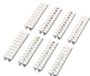
Zack marker strip, 10-section, vertically labeled with the consecutive numbers: 31 ... 40, white, width: 5 mm

Please be informed that the data shown in this PDF Document is generated from our Online Catalog. Please find the complete data in the user's documentation. Our General Terms of Use for Downloads are valid ( http://phoenixcontact.com/download )