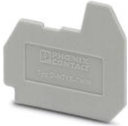
End cover, Length: 28 mm, Width: 1 mm, Color: gray

Please be informed that the data shown in this PDF Document is generated from our Online Catalog. Please find the complete data in the user's documentation. Our General Terms of Use for Downloads are valid ( http://phoenixcontact.com/download )