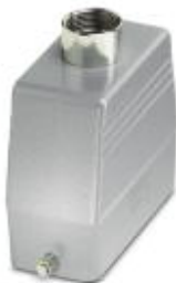
HEAVYCON sleeve housing B16, with single locking latch, height 76 mm, with support M25, straight conductor exit

Please be informed that the data shown in this PDF Document is generated from our Online Catalog. Please find the complete data in the user's documentation. Our General Terms of Use for Downloads are valid ( http://phoenixcontact.com/download )