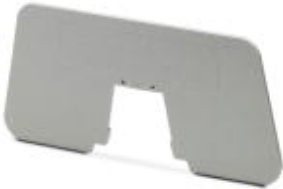
Illustration shows the product version UHV-TP 1

Separating plate, Width: 2 mm, Height: 67.5 mm, Color: gray