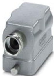
Sleeve housing, for single locking latch, height: 56 mm, with screw connection, 1 x M20, lateral cable outlet

Please be informed that the data shown in this PDF Document is generated from our Online Catalog. Please find the complete data in the user's documentation. Our General Terms of Use for Downloads are valid ( http://phoenixcontact.com/download )