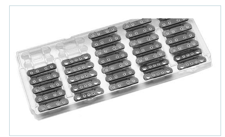
Figure 15.2 — SurfMates; individual part numbers