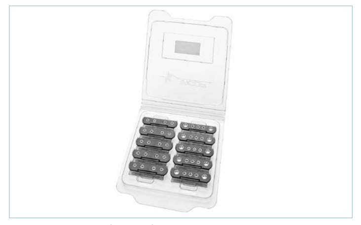
Figure 15.1 — SurfMates; five-pair sets