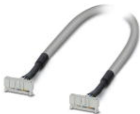
Assembled round cable with two 16-pos. socket strips, cable length: 2 m

Please be informed that the data shown in this PDF Document is generated from our Online Catalog. Please find the complete data in the user's documentation. Our General Terms of Use for Downloads are valid ( http://phoenixcontact.com/download )