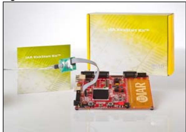
Figure 2. Starter kit

IAR KickStart kits are available for a full range of ST ARM core-based microcontrollers.