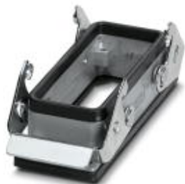
HEAVYCON panel mounting base B24, with double locking latch made of sheet steel, height 27 mm, with flat gasket

Please be informed that the data shown in this PDF Document is generated from our Online Catalog. Please find the complete data in the user's documentation. Our General Terms of Use for Downloads are valid ( http://phoenixcontact.com/download )