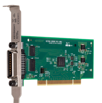
82350C with standard profile bracket

NOTE: When using 82350C with lowprofile bracket, attach the 10834A GPIBto-GPIB adaptor to increase clearance for GPIB cable or other connector.