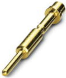
Crimp contact, turned, Single contact, contact diameter: 1 mm, crimp range: 0.06 mm 2 ... 0.25 mm 2

Please be informed that the data shown in this PDF Document is generated from our Online Catalog. Please find the complete data in the user's documentation. Our General Terms of Use for Downloads are valid ( http://phoenixcontact.com/download )