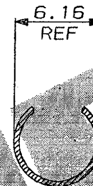
SECTION D D.