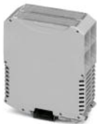
DIN rail housing, Complete housing with metal foot catch, tall design, with vents, width: 45 mm, height: 99 mm, depth: 114.5 mm, color: light gray (7035)

Please be informed that the data shown in this PDF Document is generated from our Online Catalog. Please find the complete data in the user's documentation. Our General Terms of Use for Downloads are valid ( http://phoenixcontact.com/download )