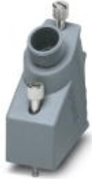
Plastic sleeve housing, locking screws with knurled head, type 1, cable screw connection Pg16

Please be informed that the data shown in this PDF Document is generated from our Online Catalog. Please find the complete data in the user's documentation. Our General Terms of Use for Downloads are valid ( http://phoenixcontact.com/download )