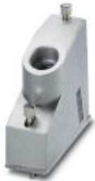
Aluminum die-cast sleeve housing, with grommet, locking screws with knurled head, for a metric M25 cable gland, angled cable outlet, type VC4

Please be informed that the data shown in this PDF Document is generated from our Online Catalog. Please find the complete data in the user's documentation. Our General Terms of Use for Downloads are valid ( http://phoenixcontact.com/download )