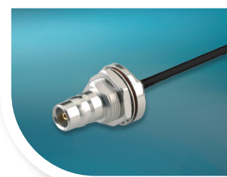
QN STRAIGHT BH JACK