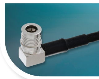
QMA R/A PLUG