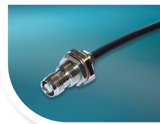
TNC STRAIGHT BH JACK