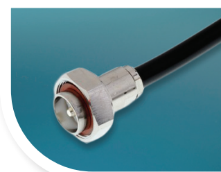
7/16 STRAIGHT PLUG