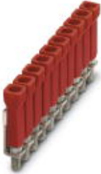
Jumper, Number of positions: 10, Color: red

Please be informed that the data shown in this PDF Document is generated from our Online Catalog. Please find the complete data in the user's documentation. Our General Terms of Use for Downloads are valid ( http://phoenixcontact.com/download )