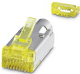
Male insert RJ45, CAT6 A , 10 Gigabit

Please be informed that the data shown in this PDF Document is generated from our Online Catalog. Please find the complete data in the user's documentation. Our General Terms of Use for Downloads are valid ( http://phoenixcontact.com/download )