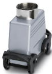
HEAVYCON coupling housing B16, with double locking latch, height 80 mm, with supports 1x Pg29

Please be informed that the data shown in this PDF Document is generated from our Online Catalog. Please find the complete data in the user's documentation. Our General Terms of Use for Downloads are valid ( http://phoenixcontact.com/download )